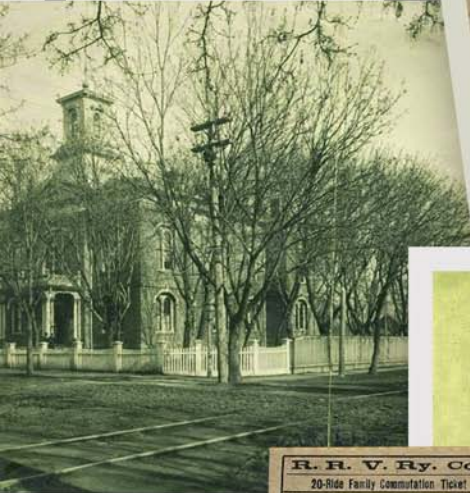
Jacksonville Courthouse circa 1900