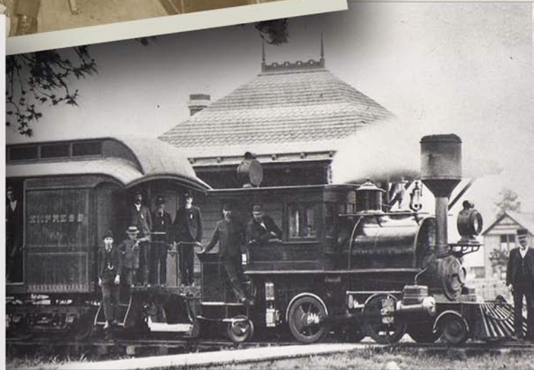
RRVRR # 1 Original. Looking North Jacksonville, Oregon

It is altogether probable that the Rogue River Valley short line has the youngest conductor in its employ of any railroad in the world. His age is in the immediate